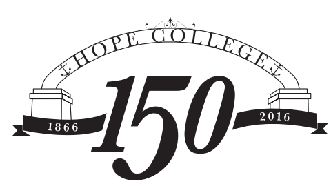
PMS 289: One-color Logo

One Color and Black – The acceptable color is Hope Blue (PMS 289). An all black version may be used for black and white projects.