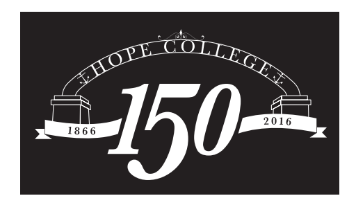
Black & White One-color Reversal